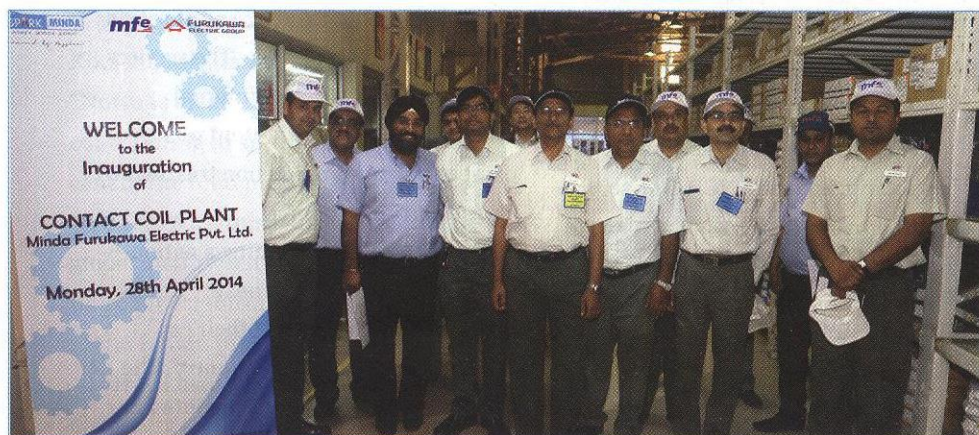
Senior management of Maruti Suzuki along with officials of MFE during a tour of the new plant