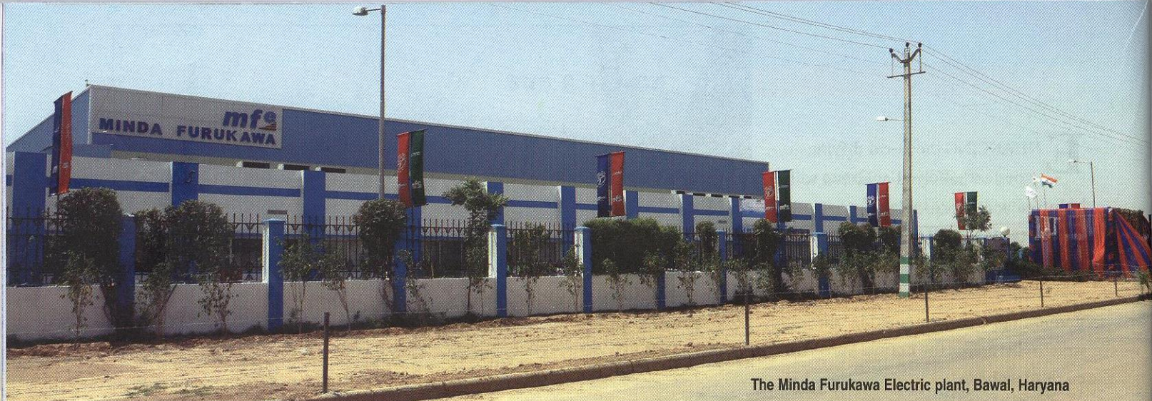
The Minda Furukawa Electric plant, Bawal, Haryana